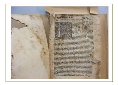
Angelo Poliziano's 1512 work on classical philology. This book was severely damaged by mould and has taken over six months to repair at a cost of £1500.