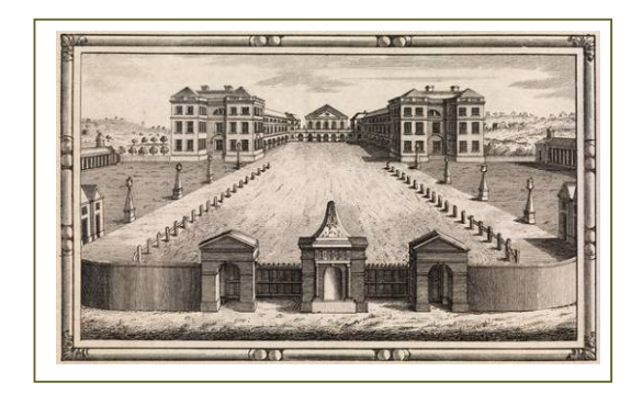
A view of the Foundling Hospital in Lambs Conduit Fields, founded in 1739 by Thomas Coram. From a work by Henry Chamberlain printed in 1770.