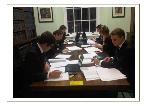
Pupils hard at work in the library on Monday 13 January 2014

Uptake has not been as high as we expected, so it remains to be seen if ebooks are the way forward for legal research purposes. Let us know what you think.