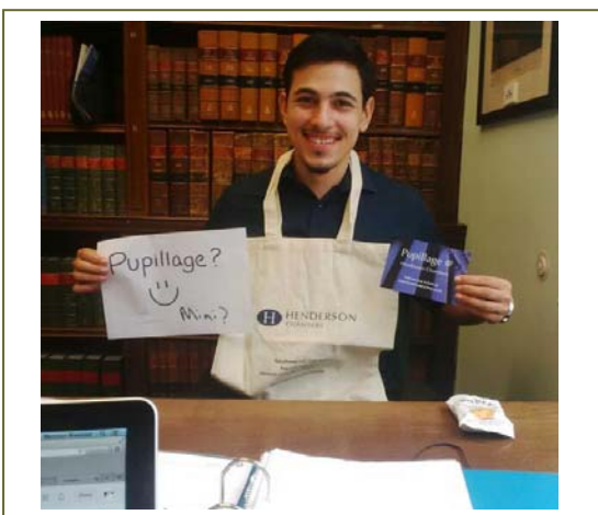
Henderson Chambers goodie bag received in response to tweets asking about pupillage