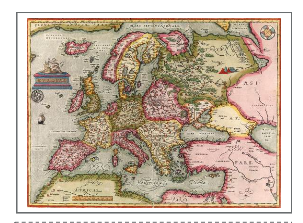
A map of Europe from Theatrum orbis terrarum, Abraham Ortelius, 1603

Library of Congress subject headings were first created in 1898 and are updated and approved on a monthly basis