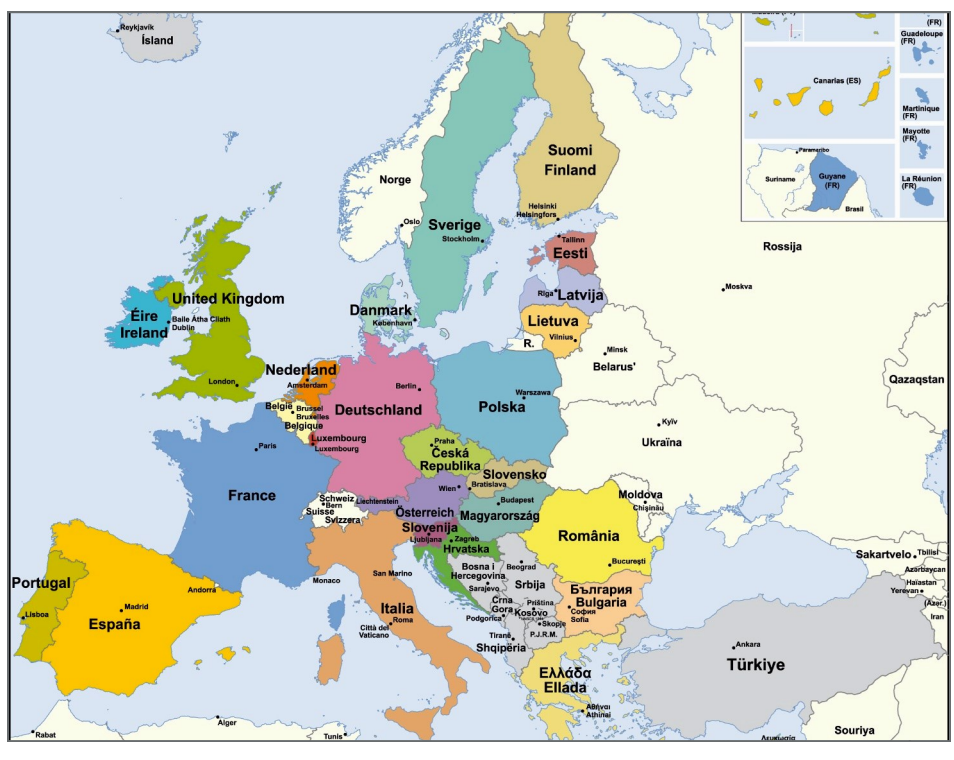
Map of Europe ©European Union, 2014