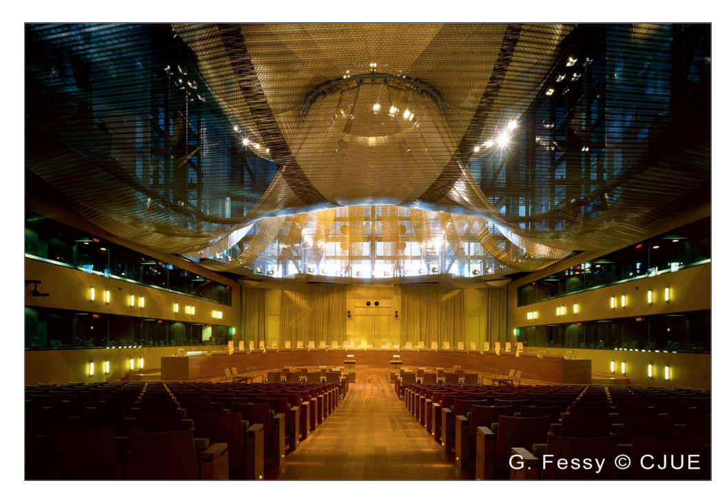
Main Courtroom of the Court of Justice of the European Union